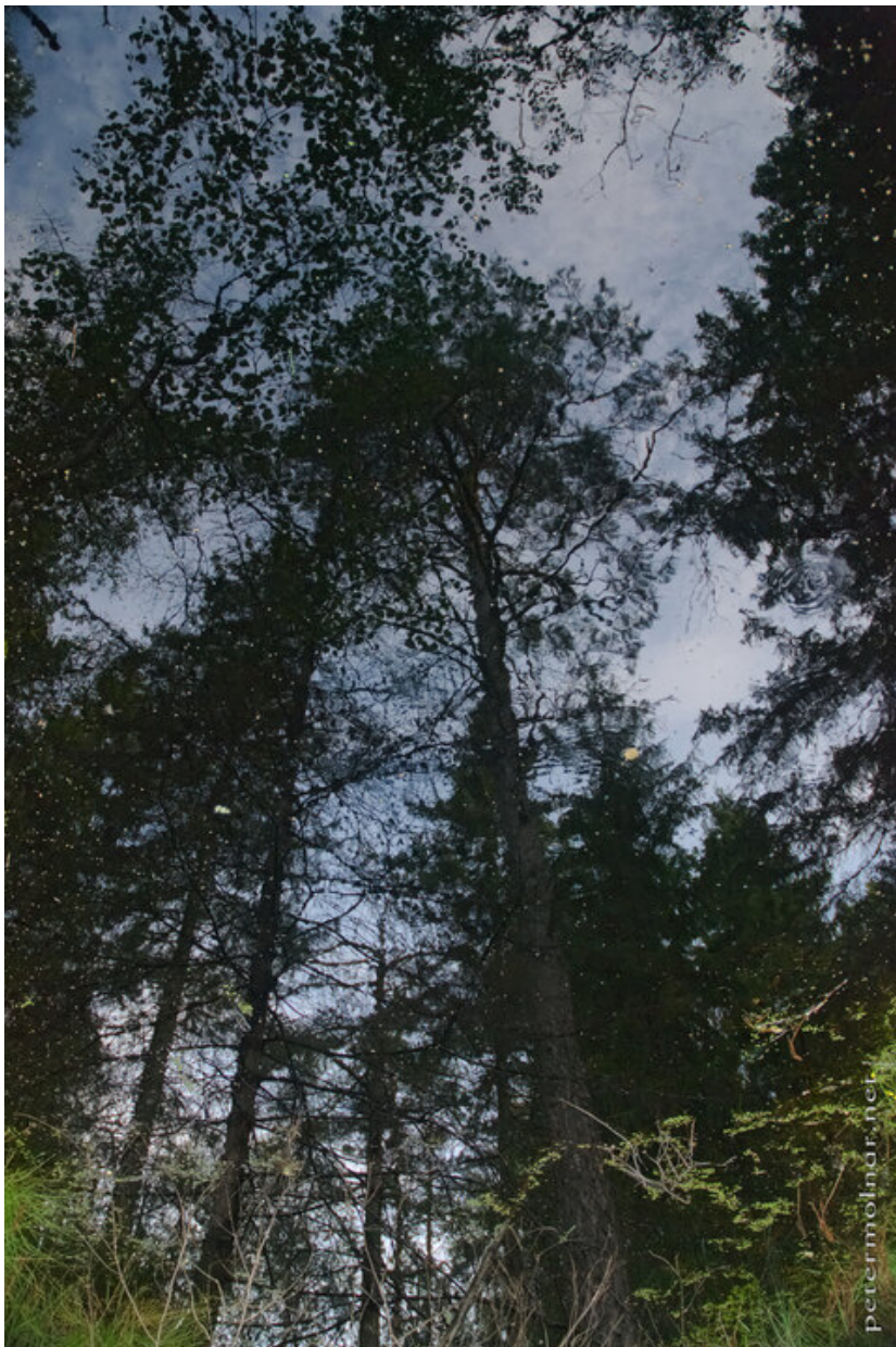
NIKON D80, 18.0 mm, f/3.5, 1/60 sec, ISO 400 | AF-S DX Zoom-Nikkor 18-70mm f/3.5-4.5G IF-ED | CC-BY-NC-ND-4.0

Norra Lunsen has some deep, truly black waters where it's hard to tell the reflection apart from a normal view. This was the place where I finally understood, why the "little duck bathes in black lake" in a childhood verse.