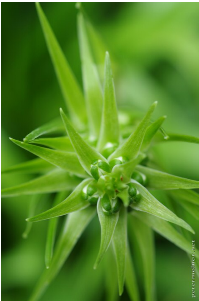
PENTAX K-5 II s, 35.0 mm, f/5.0, 1/80 sec, ISO 400 | smc PENTAX-DA 35mm F2.4 AL | CC-BY-NC-ND-4.0