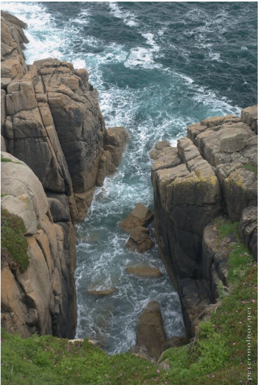
NIKON D80, 34.0 mm, f/11.0, 1/30 sec, ISO 200 | AF-S DX Zoom-Nikkor 18-70mm f/3.5-4.5G IF-ED | CC-BY-NC-ND-4.0

The Minack Theatre [1] is a surreal place: until you learn it's story you're sure it's a leftover from the Greek times.