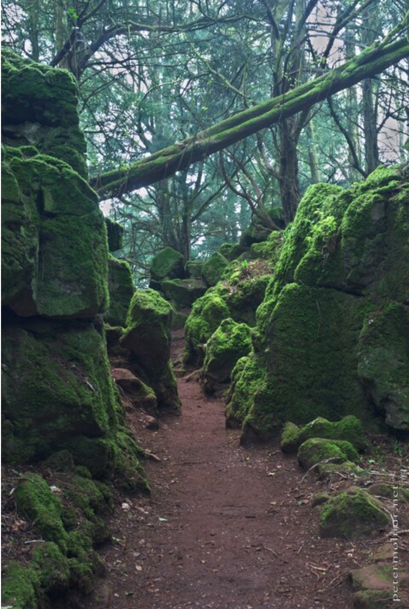
NIKON D80, 34.0 mm, f/11.0, 1 sec, ISO 400 | AF-S DX Zoom-Nikkor 18-70mm f/3.5-4.5G IF-ED | CC-BY-NC-ND-4.0