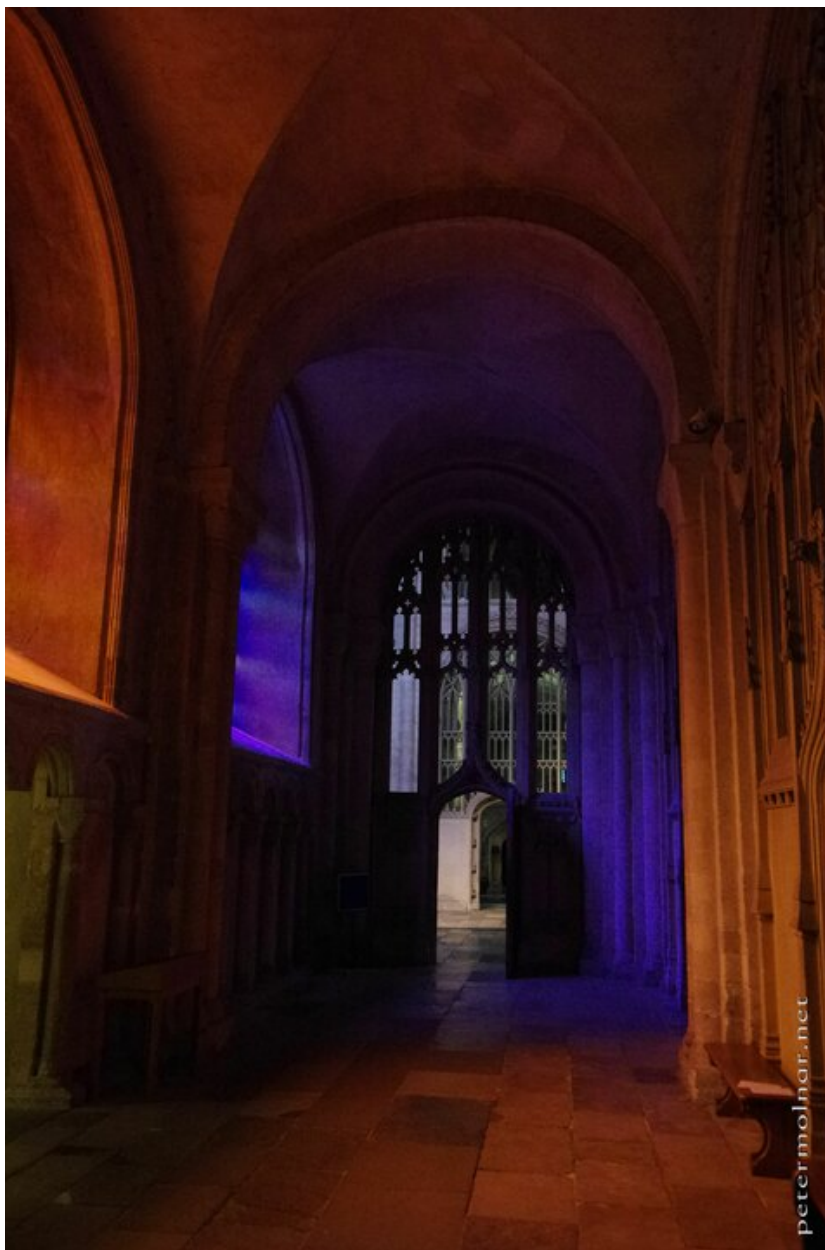
PENTAX K-5 II s, 18.0 mm, f/5.0, 1/60 sec, ISO 6400 | smc PENTAX-DA 18-135mm F3.5-5.6 ED AL [[IF] DC WR | CC-BY-NC-ND-4.0

The Norwich Cathedral has some very modern, very strange stained glass at the end of the left corridor which renders the area orange and purple during the afternoon.