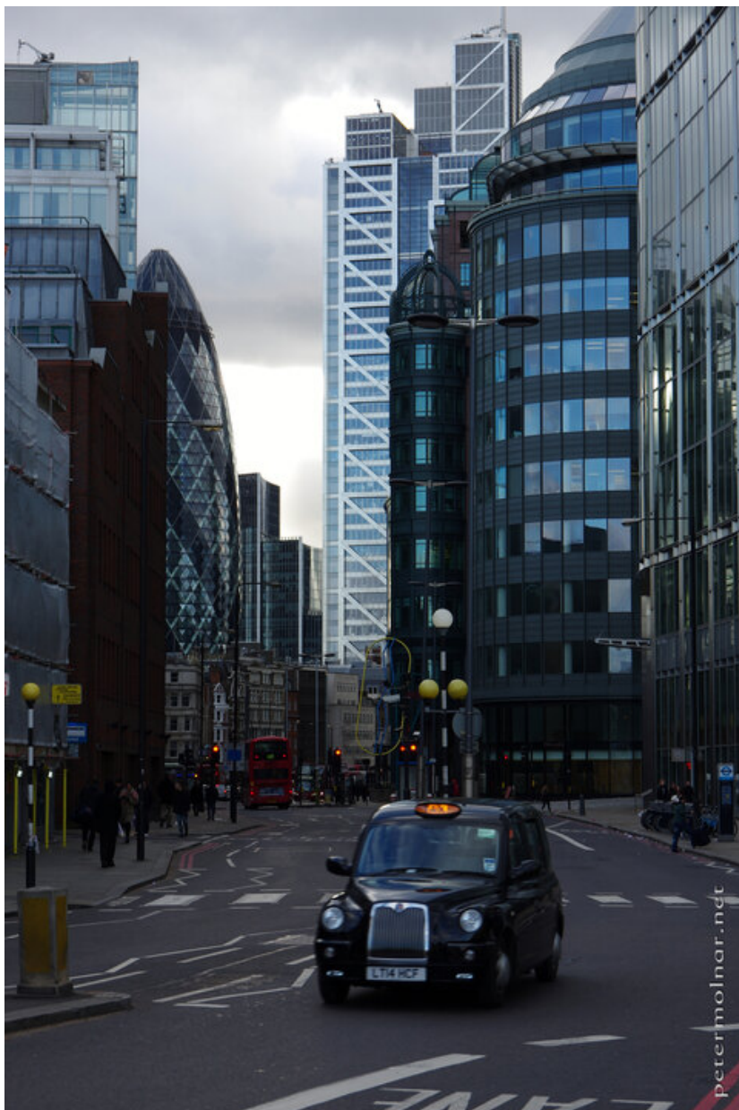
PENTAX K-5 II s, 48.0 mm, f/8.0, 1/80 sec, ISO 100 | smc PENTAX-DA 18-135mm F3.5-5.6 ED AL [IF] DC WR | CC-BY-NC-ND-4.0

I had a day out in London, visiting a few markets around Spitalfields. When I headed back to the station the sun came out for a few moments from the clouds and the street was nearly abandoned.