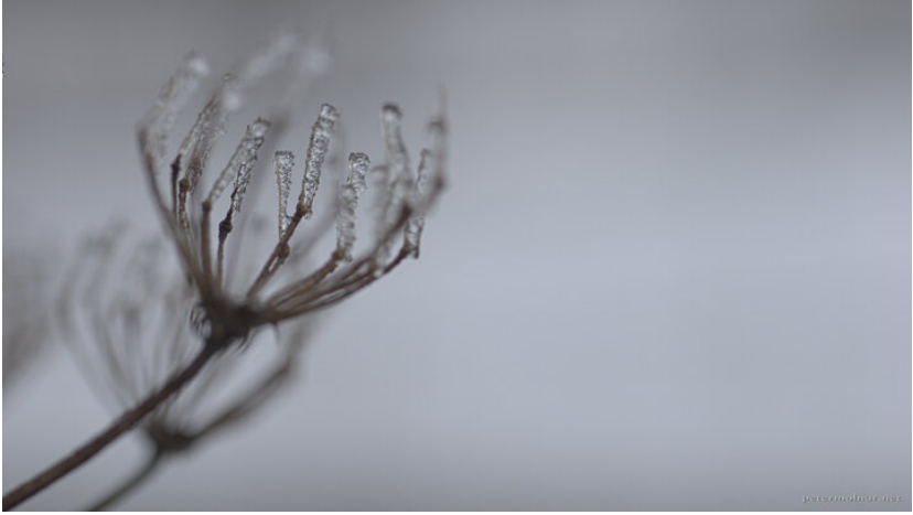
PENTAX K-5 II s, 70.0 mm, f/4.5, 1/800 sec, ISO 200 | CC-BY-NC-ND-4.0

The Midlands do get some snow and proper winter, but not much. Yet somehow we ended up in the only foggy spot on probably the whole Britain on a Sunday when everywhere else the sun was shining. The trip was worth it regardless of this.